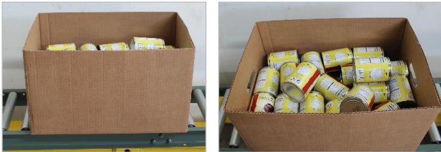
Image 1. Fully packed food drive box. Box dimensions: 19x13x11. No more than 50 pounds.