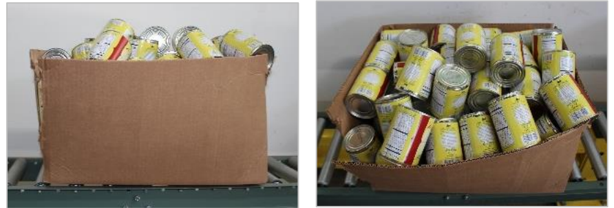
Image 2. The box is filled past the folding flaps, and is ripped, making it likely to break when lifted, and causing the cans to fall out.